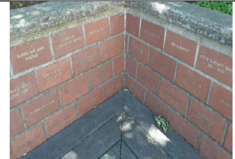
Memorial bricks in courtyard at Keizer Cultural Center