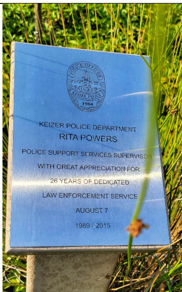
Rita Powers, born in Nuremburg Germany in 1955. First baby girl adopted into the state of Oregon from another country.