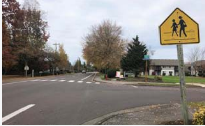
WHEATLAND ROAD AT PARKMEADOW DRIVE