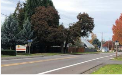
WHEATLAND ROAD AT RUSSETT DRIVE