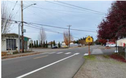
WHEATLAND ROAD AT CLEAR LAKE ROAD