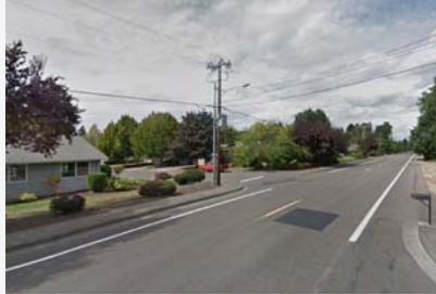
WHEATLAND ROAD AT ALDRIDGE DRIVE