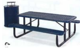
4', 6', 8' and 10' lengths