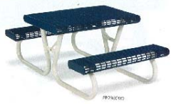
4' and 6' lengths