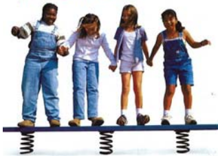
Walking the Plank